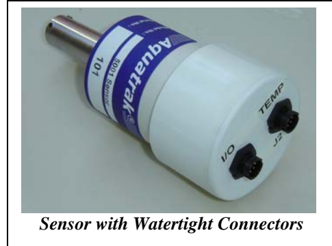
Sensor with Watertight Connectors