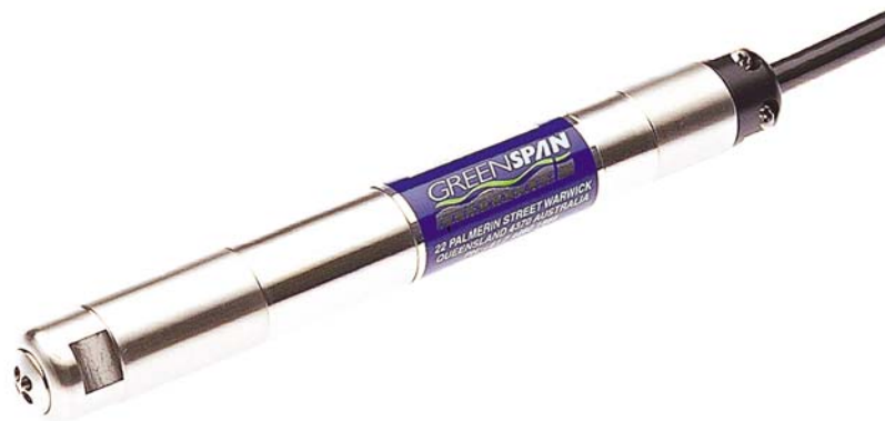
PS700 Pressure Sensor

The changes in the capacitive element varies with applied pressure. This variation is measured by an electronic circuit and converted into a current ranging from 4mA at zero pressure to 20mA at full scale. The sensor can be supplied in a variety of standard ranges.