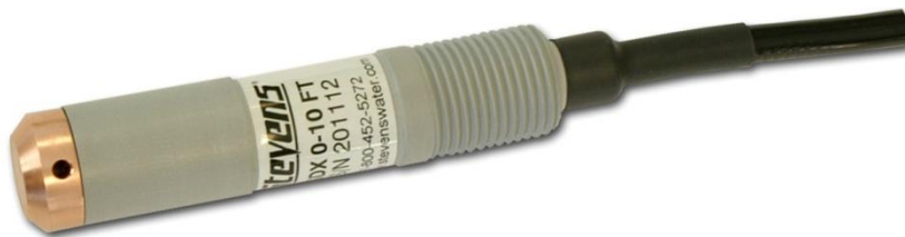
Stevens SDX Figure 1

WARNING - This equipment generates, uses, and can radiate radio frequency energy, and, if not installed in accordance with the instructions manual, may cause interference to radio communications. It has been tested and found to comply with the limits for a Class A computing device pursuant to Subpart J of Part 15 of FCC Rules, which are designed to provide reasonable protection against such interference when operated in a commercial environment. Operation of this equipment in a residential area is likely to cause interference in which case the user at his own expense will be required to take whatever measures may be required to correct the interference.