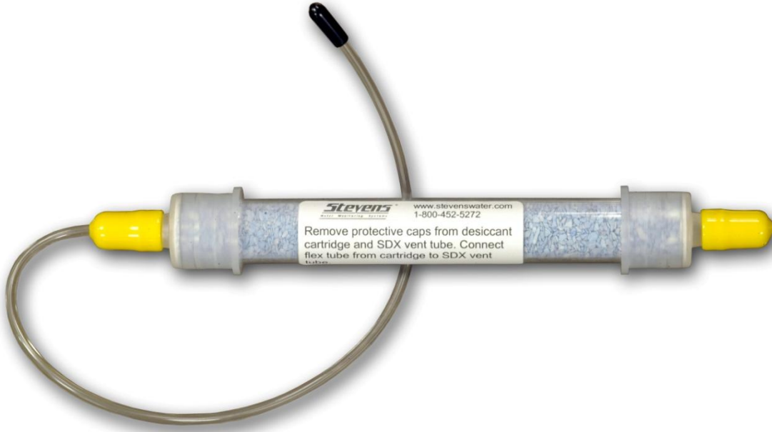
Optional Desiccant Cartridge Figure 3

The pressure transducer used is a “Wet-Wet” device. While it is important to keep the SDX cable’s vent tube unobstructed for barometric pressure compensation, this feature results in neither the pressure transducer nor internal electronics becoming damaged by condensation or moisture entering the SDX cable’s vent tube. However, it is possible for vapor to condense into water which could create an offset in the transducer output. Therefore, Stevens recommends the desiccant cartridge with vent tube adapter be installed to prevent moisture from entering the vent tube.